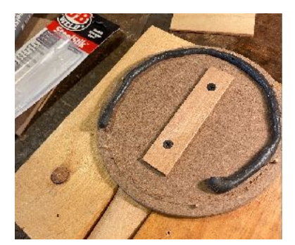
5 The glass needs to be pressed into a bead of silicone caulk or thick epoxy. Apply pressure gently and gradually to avoid breaking the glass.